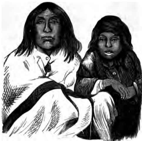
SCOKYSLYANK, INDIAN MOTHER AND PAPPOOSE.

We prevailed upon one of the native females to